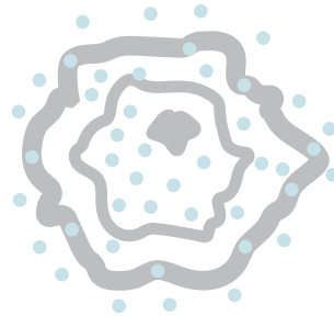
ATTACK CREATES OXIDATIVE STRESS